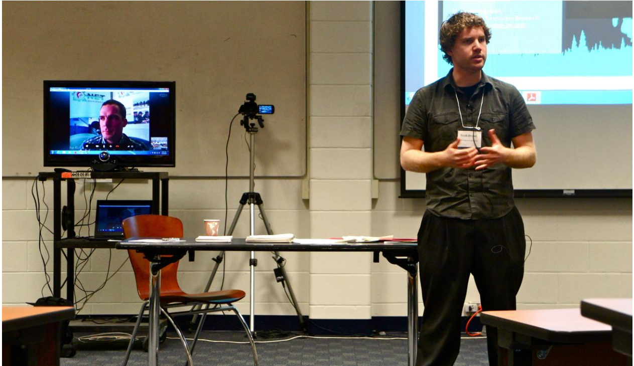
Guelph Seminar, Glocal Classroom.

The road ahead for our program and the wider institution is to keep on enriching the student experience in communication for social and environmental change as well as exploring new partnerships. Partnerships have at their core a strategic mission to link community practitioners, scholars, researchers and technical specialists working together to use new technologies to create a vertically integrated innovative pedagogical environment. We are mindful of principles of diversity and inclusiveness in the way forward. In our experience, teaching and learning innovations will help to make more efficient use of existing resources and open up new networks of knowledge and support. These efforts motivate faculty and enable student opportunities in their degrees and into their careers as glocal communicators ideally continuing to learn and work in and alongside diverse communities around the world, including those in rural and remote areas.